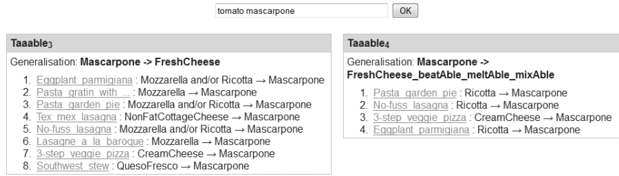
Fig. 3. TAAABLE 3 and TAAABLE 4 's answers to Q = \text{Tomato} \wedge \text{Mascarpone} .

The substitutions proposed by TAAABLE 3 are more various than the ones proposed by TAAABLE 4 . With TAAABLE 4 , mascarpone is substituted for ricotta or cream cheese, while TAAABLE 3 additionally proposes to substitute mascarpone for mozzarella, non-fat cottage cheese or queso fresco. And the larger the set of substituting ingredients, the more likely the adaptation is to fail, because there is less similarity between the ingredients.