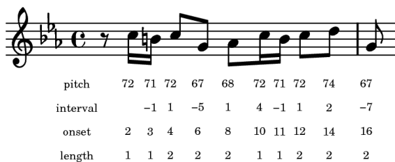
Figure 1. A monophonic series of notes (start of Fugue #2, see Figure 4), represented by (p, o, \ell) or (\Delta p, o, \ell) triplets. In this example, onsets and lengths are counted in sixteenthths, and pitches and intervals are counted in semitones through the MIDI standard.

A note x is described by a triplet (p, o, \ell) , where p is the pitch, o the onset, and \ell the length. The pitches can describe diatonic (based on note names) or semitone information. We consider ordered series of notes x_1 \dots x_m , that is x_1 = (p_1, o_1, \ell_1), \dots, x_m = (p_m, o_m, \ell_m) , where 1 \leq o_1 \leq o_2 \leq \dots \leq o_m (see Figure 1). The series is monophonic if there are never two notes sounding at the same onset, that is, for every i with 1 \leq i < m , o_i + \ell_i \leq o_{i+1} . To be able to match transposed patterns, we consider relative pitches, also called intervals : the interval series is defined as \Delta x_2 \dots \Delta x_m , where \Delta x_i = (\Delta p_i, o_i, \ell_i) and \Delta p_i = p_i - p_{i-1} .