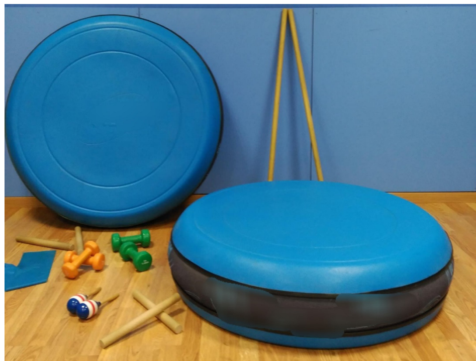
Figure A2. The air dissipation platform (ADP), materials such as dumbbells, elastic bands, maracas, sticks and paddles used in the sessions.