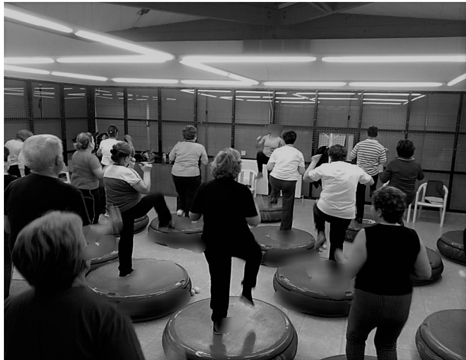
Figure A1. Session of ADP with the elderly.