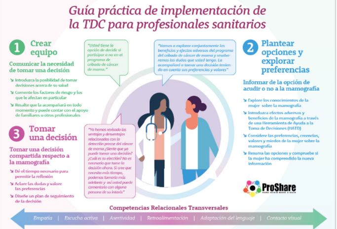
Figure 3 Changes made to the guide.

support from a third person to make the decision (figure 4).