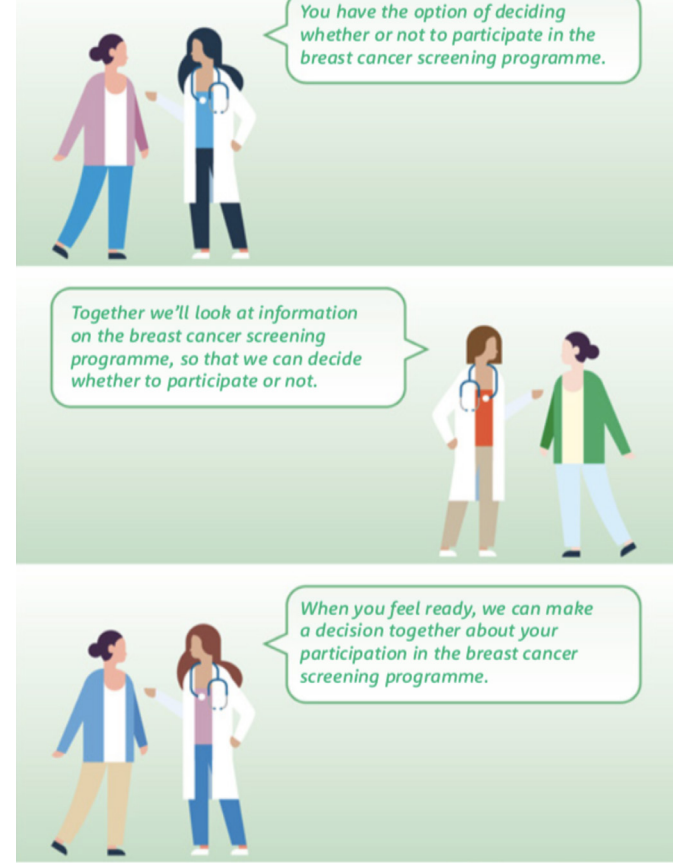
Figure 4 Example of dialogues for the professionals in the 'team talk' step.

The decision on the flow diagram was affected by whether participants came from the region of Catalonia (of those living in Catalonia, 5/6 wanted to keep it, although improving its resolution; in contrast, the specialists from outside Spain (7/11) opted to remove it). Given that the objective of the handbook is to be used in other territories, the research group decided to eliminate the flow diagram.