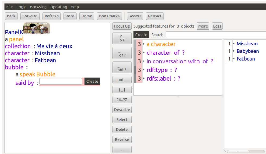
Fig. 2. Screenshot of Sewelis. On the left side, the description of new object is shown, here the panel K is a panel from the Ma vie à deux Collection, with Missbean and Fatbean as characters, it has a speech bubble said by someone. On the right side, suggested resources for the focus are listed, here the speakers.