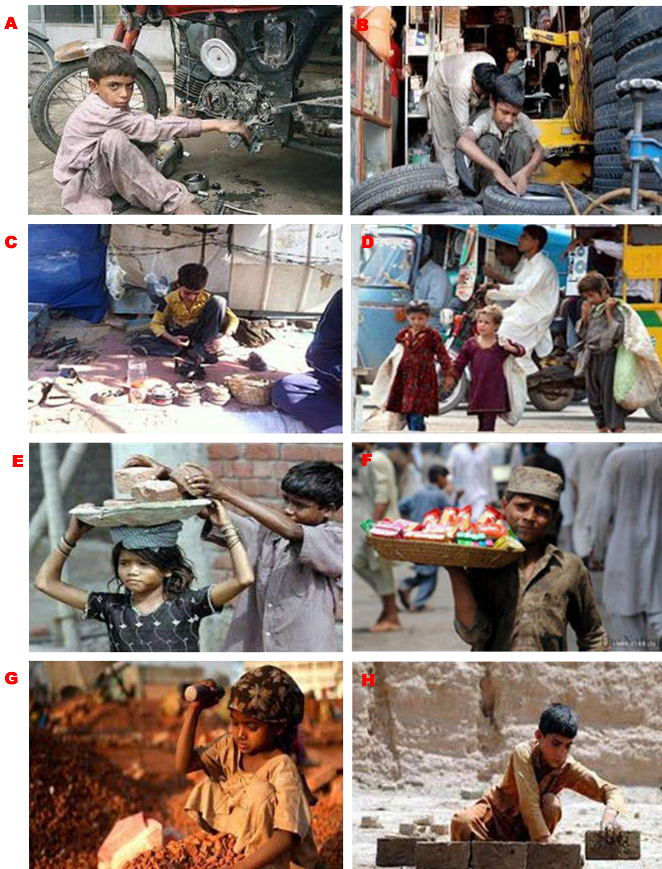
Figure 1: Pictorial Representation of Child Labour. (A) Child working in Autoworkshop, (B) Child Working in Tyre Puncture Shop, (C) Child Working as Cobbler, (D) Children Working as Garbage Collector, (E) Child Working as Brick Loader, (F) Child Working as Confectionery Seller, (G) Child Working as Crusher and (H) Child Working as Brick Maker