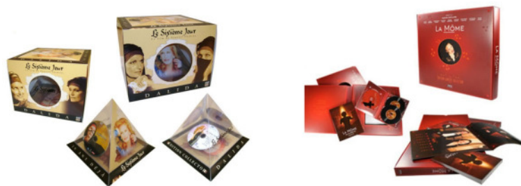
Figure 3. Special packaging using replicator's and business partner's core competency (BDMO. 2009)

Developments of luxury packaging (technology plus marketing) are permanently taking place, but use R&C of specialised packaging manufacturers like, e.g., Belgium-French specialist BDMO S.A. These activities are usually not generating new business and their innovative degree is placed in the transilience maps niche quadrant, since addressing a high-end niche market. Further, such hi-end packaging is usually accompanied by a cheaper parallel version using standard packaging. Such innovation takes place with each specific product and is changing from product to product. Frequently new material technologies, part of business partners' R&C, are used to manufacture the specific packaging model (Figure 3).