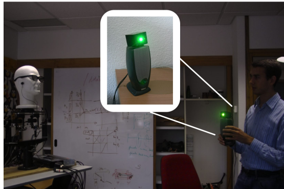
Fig. 2. Audio-visual device used to align the auditory and visual spaces. An LED light bulb is mounted onto a speaker which makes the visual localization more precise. White noise is played throughout the recording to improve the auditory localization.

The remainder of the paper is organized as follows. Section II describes the audio-visual alignment model. This leads to a maximum likelihood formulation and to an associated EM algorithm that is described in detail in Section III. Results obtained with simulated and real data are shown in Section IV. Section V concludes the paper along with a short discussion.