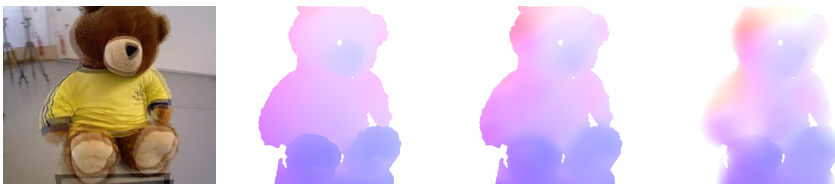
Fig. 2. Camera motion. From left to the right : a) Input images. b) Optical flow of the rigid motion estimation. c) Optical flow using the proposed method. d) Optical flow by the scene flow method [13]. Results of the proposed method are clearly more accurate than those of [13].

this scene presents a changing 3D motion field due to the translation and rotation of the sensor. We first estimate a single rigid motion as is presented in Sec. 4.4. We estimate the parameters using every second pixel with a range between 50 cm and 150 cm from the sensor. At each level of the pyramid we run 100 iterations. This result is taken as baseline and compared in Figure 2 with resulting optical flows of our method and the dense estimation provided by [13]. The proposed method produces a close estimation of the camera motion without assuming a global rigidity of the scene. In contrast, the direct regularization on the scene flow components, as is performed in [13], fails to capture the diversity of 3D motions introduced by the camera rotation.