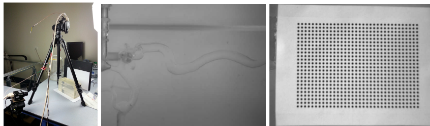
Fig. 2: (left) Experimental setup, showing the top and side camera, observing the silicon vascular phantom; (middle) image of the phantom by the top camera; (right) calibration pattern used to compute the equation of the refractive plane (inter-bullet distance=2 mm)

This test bench is composed of a motorized spool that pulls over one meter of bare electric wire, with a negligible elongation factor and a constant diameter of 1.54mm (close to interventional radiology tools). While the electric wire diameter