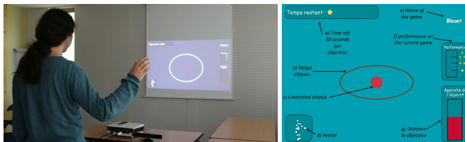
Fig. 1. a) Subjects are exploring how to control an ellipsis displayed on the screen in front of them by moving their body joints tracked by a Kinect device. b) Details of the interface shown to the user on a screen in front of them: in particular, you can see the controlled ellipsis (in red) and the target one (in brown).

This experimental setup is designed as a game setting human subjects into an intrinsically motivated activity [11]. Participants can freely explore and shift between several games, each being about finding a mapping between their movements (body joints