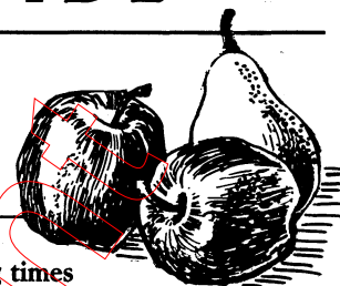
Table 1. Home Drying of Fruits