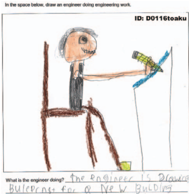
Figure 1. Student DAET Drawing, with example identification number.

to coding in an effort to reduce coder bias, forcing coders to judge drawings based only on the content provided by the students and not on any identifying student information. Additionally, the identification number prevented the coder from knowing if the drawing being evaluated was a pre or a post drawing, thus further reducing bias.