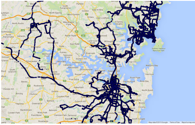
Fig. 1: Geo-distribution of the collected SSIDs in Sydney

studied the names of user devices that are sending mDNS in a WiFi network and found that 59% of the device names contained real names and 17.6% contained both first name and last name. Ferreira et al. [15] investigated the effect that trust and context have on users when choosing wireless networks. For example, it was shown that users tend to connect to the networks known to them or have connected in the past, despite not completely trusting them.