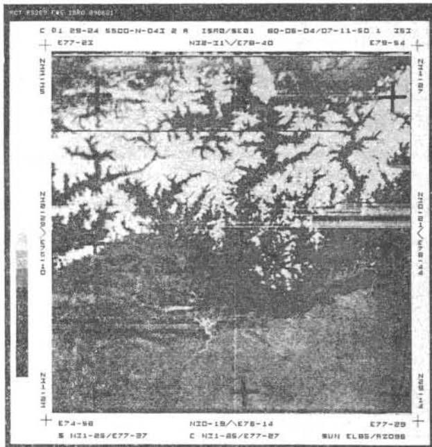
Fig. 2: Pseudo coded photo-thematic-map from figure 1