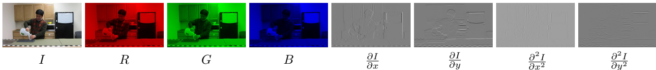
Figure 3: Seven low-level appearance features extracted in a sample video frame from the URADL dataset.