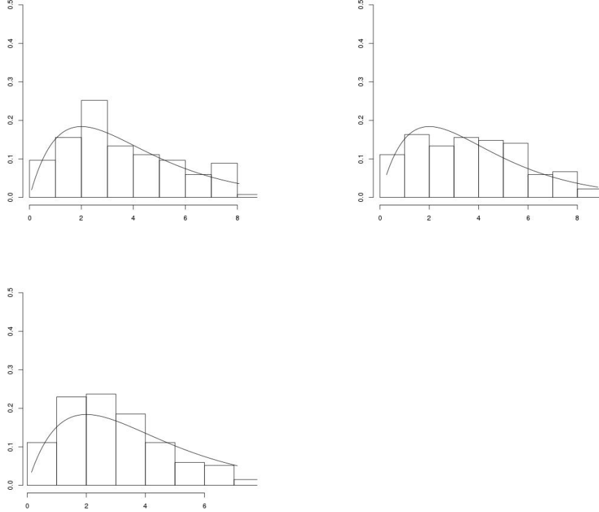
Figure 1: Histograms of n(\hat{\boldsymbol{\theta}}^{(r)} - \boldsymbol{\theta}_0)^T \boldsymbol{\Xi}(\hat{\boldsymbol{\theta}}^{(r)})^{-1}(\hat{\boldsymbol{\theta}}^{(r)} - \boldsymbol{\theta}_0) , r = 1, \dots, 200 together with the density of a \chi_d^2 distribution. The considered experiment parameters were n = 500 and d = 4 . Upper left: (S2). Upper right: (S1). Bottom: (S3).

Let \boldsymbol{\theta}_0 denote the true parameter vector and let p_T = p_T(\boldsymbol{\theta}_0) . The estimation of p_T , or, in other words, the estimation of \boldsymbol{\theta}_0 , was performed in [8] for all the pairs of d = 3 sites in Italy (Airole, Merelli and Poggi). The parametric model proposed for C was the extreme-value copula