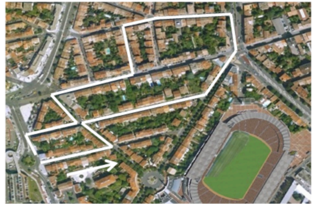
FIGURE 2 | The route learned by the participants. Adapted from Taillade et al. (2013, 2014).

measure was required. To this end, we have performed preliminary test of normality of collected data (Kolmogorov-Smirnov procedure). This preliminary test revealed that all the data exhibit normal distribution except for the measure of picture classification task ( p < 0.01 ). Consequently, we have performed the two-way ANOVA analysis for all the measures except for that from the picture classification task. For this latter case, non-parametric analyses have been performed as recommended for non-normal distribution, with the corrected Mann-Whitney