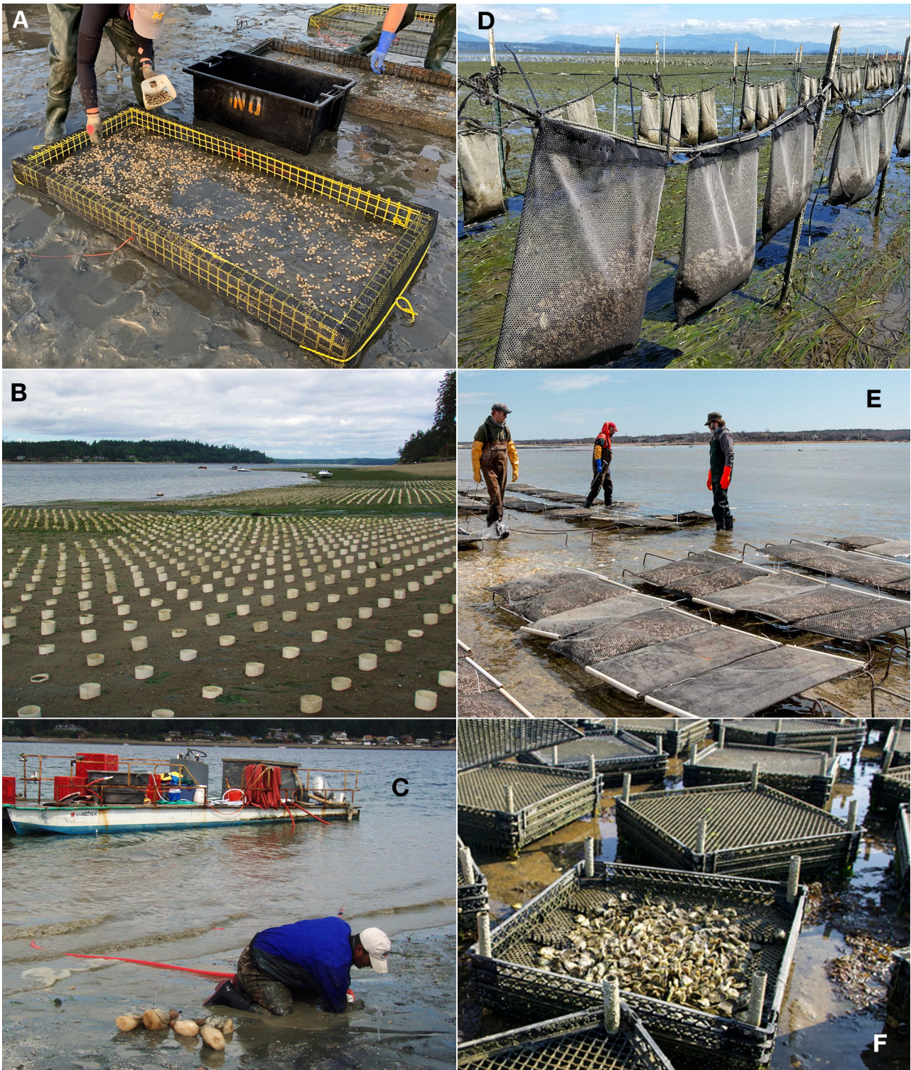
Fig. 2. Examples of intertidal shellfish aquaculture. (A) On-bottom clam farm seeded with spat (photo: by Pangea Shellfish Company). (B,C) On-bottom geoduck Panopea generosa farm and subsequent harvesting using a high-pressured water jet powered by a support vessel (photos: Jeff Cornwell). (D) Hanging-bag oyster farm (photo: Penn Cove Shellfish). (E) Rack-and-bag oyster farm (photo: Pangea Shellfish Company). (F) Tray culture oyster farm (photo: Pangea Shellfish Company)