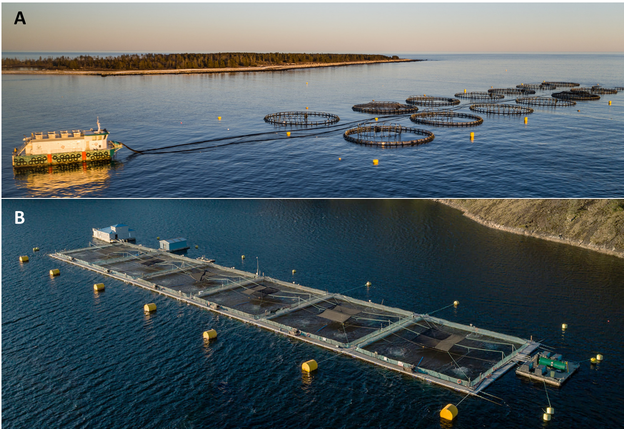
Fig. 4. Examples of large, modern finfish farms. (A) Feed barge delivering feed to circular open net-pens via a series of pipes and blowers. (B) Farm with square net-pens using a similar feed system; however, there are also oxygen aeration units, and storage and accommodation facilities

the carbon released by fish farms occurs as 'particulate wastes' which derive from faeces and uneaten feed (Islam 2005, Wang et al. 2012, Reid et al. 2013). These particulate wastes quickly settle onto the sea-floor and rarely disperse more than a few hundred metres (Brager et al. 2015, Price et al. 2015, Bannister et al. 2016, Filgueira et al. 2017). Consequently, these wastes can accumulate under net-pens, resulting in a nutrient-enriched layer of organic matter overlying the sediment. This organic enrichment can increase bacterial decomposition and may lead to oxygen depletion and a build-up of sulphides (Holmer et al. 2007, Pusceddu et al. 2007, Hargrave 2010, Price et al. 2015, Hamoutene et al. 2018). However, the quantity of particulate wastes produced by finfish aquaculture has been significantly reduced over the last 3 decades due to the development of more efficient feeds and feeding systems (Islam 2005, Sørensen 2012, Sprague et al. 2016).