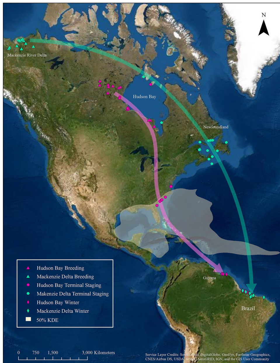
Figure 1. Stylized map of fall migration pathways for Mackenzie Delta and Hudson Bay populations and their overlap with the core area for tropical cyclone activity. Each triangle, circle, and diamond represent centroids for breeding territories, terminal staging locations, and wintering territories for each year and each individual. This figure was produced in ArcGIS 10.7.1 by an author: https://www.esri.com .

birds vulnerable to additional storm encounters. Five (71%) of the 7 birds that were not lost on islands were hit by storms while grounded.