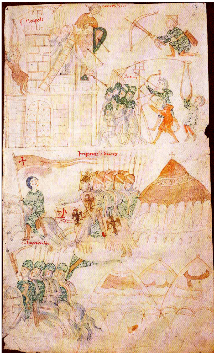
Bibliothèque de la Bourgeoisie de Berne, Cod. 120, c. 109r.