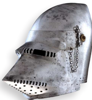
Bacinetto con visiera a becco di passero, Milano 1400-1430, Museo delle Armi "Luigi Marzoli" (inv. E 2)