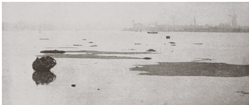
Fig. 4 Peter Henry Emerson, Low Water on Breydon (1890)

The great Victorian photographer Peter Henry Emerson regarded Spencer as a kind of intellectual hero. 8 And Emerson suffered a kind of crisis of faith in photography. The details are too much for this conclusion, but he was worried that there wasn't enough room for the photographer's agency in the making of a properly photographic picture. In fact, after fulminating about the kind of work that could count as properly photographic for several years, Emerson's crisis led him to renounce photography as an art. He nevertheless continued for several years to publish photographic books. Actually, I don't think he ever stopped wrestling with the question of photographic agency. 9