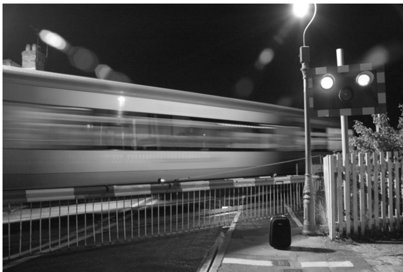
Fig. 2 Dawn M. Wilson, Photograph (n.d.)

I don't share it with them. I don't think it's right. Dawn Wilson has recently offered a criticism of Scruton's account of photography. Roughly, Wilson argues that, even without retouching (or some other nonphotographic manipulation), a photograph could indeed be made to show something that looked different from the pro-filmic event. She argues that the making of a photograph is a multi-stage process that includes key decisions about processing and materials and that it includes them not incidentally, as Scruton and Iversen treat them, but constitutively. Otherwise, holding an empty frame up to the space before one's eyes could count as a photograph. 5 Thus we have a multi-stage event—the photographic event—that includes a “merely causal relation” to the pro-filmic event and another part that may permit this “causal phenomenon” to “be mastered and creatively exploited by skilled artists” (“Photography and Causation,” 340). Thanks to this mastery, the photograph can, perhaps, come to stand in an “intentional relation to the subject” because the “causal relation places no constraints on what a photograph may depict.” I take this to mean that the photographic image's causal relation to its subject does not necessarily determine what the photograph looks like; a skilled artist may be able to harness it to an intention and so make the photograph “transparent to human intentionality” (“Photography and Causation,” 340).