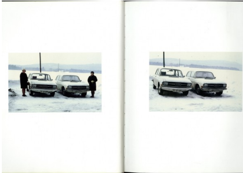
Fig. 1 Tacita Dean, from Floh (2001)

is just to collect, arrange, juxtapose, in a matter-of-fact way, this assortment of photographs Dean found and bought.