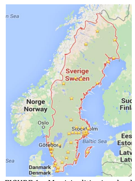
FIGURE 1 Municipalities involved in the research

The survey was conducted at the end of 2012 and at the beginning of 2013. The questionnaire included 46 likert-type items about preschool teachers' approach to children's competences and abilities and also about the grounds for dividing children into groups. Other questions in the survey were fixed-format or open-ended questions. Altogether 698 preschool teachers from 46 municipalities across Sweden answered the questionnaire (see Figure 1), representing thus approximately 16 per cent of the Swedish municipalities. According to Figure 1, the geographical distribution of responses was not even, however, as one third of the responses came from the two largest cities: Stockholm and Gothenburg. From 16 municipalities the data were received from one respondent only. The study follows the Swedish research council guidelines and ethical rules in social science research.