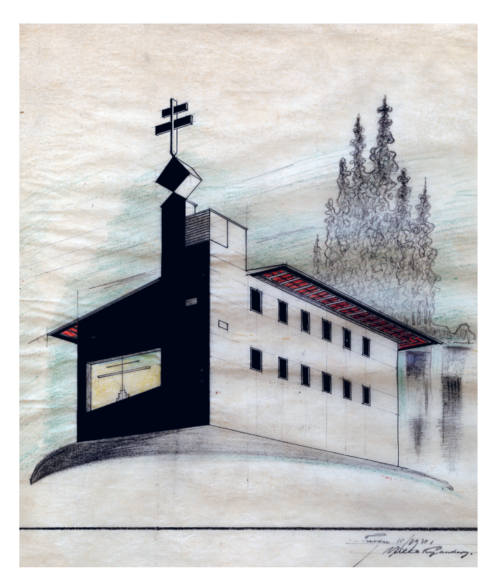
Figure 1. A modernist sketch plan for an Orthodox chapel or church by Veikko Kyander from May 1930.