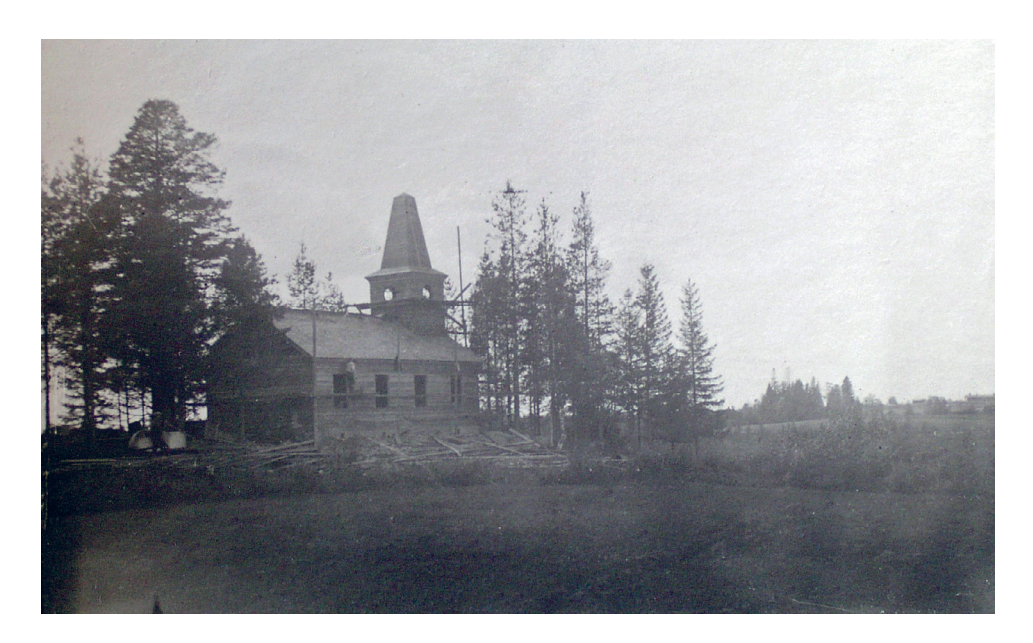
Figure 3. A photograph showing a village chapel under construction. It lacks the contextual information of time and place, but according to the analysis of the landscape it is mostalikely from the village of Hyrsylä, Suojärvi, where one of the type plan chapels was erected in 1932.

Despite the fact that Veikko Kyander's sketch plans were not realised, his contribution is intriguing. According to written sources, the Committee explained – with good cause – that he was chosen as a specialist of the traditional Karelian vernacular architecture. Nevertheless, the correspondence between Härkönen and Kyander indicates the aim of creating something completely new, with no efforts to copy a given existing traditional Orthodox village chapel. To my knowledge, this was the first, and one of few attempts to discuss a contemporary Finnish modern idiom for Orthodox church architecture. Further, it is intriguing that the tracks of linking Byzantine or Early Christian inspiration and motifs to the 'national Finnish' lead to the interwar period. Finnish historical research is acquainted with the idea of emphasising connections between Karelia and Byzantium since the 1960s, but the subject requires further research in the field of Orthodox church architecture in Finland.