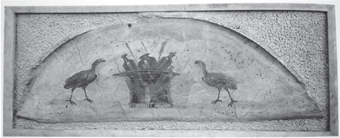
Fig. 1. Lunette from the back wall of the Tomba di Morlupo, now in the Museo Nazionale Romano (Rome) with Purple Swamp-hens ( Porphyrio porphyrio ) (from Cappelli, 192 fig. 66).

Morlupo and Capena, a little more than thirty kilometres from Rome. It was found in the early 20 th century and briefly published by D. Vaglieri in 1907. 3 The lunette originally on the short back wall (Fig. 1), under which there was a loculus for urns, and the lunette on the opposite entrance wall (Fig. 2) show birds in so-called still lifes.