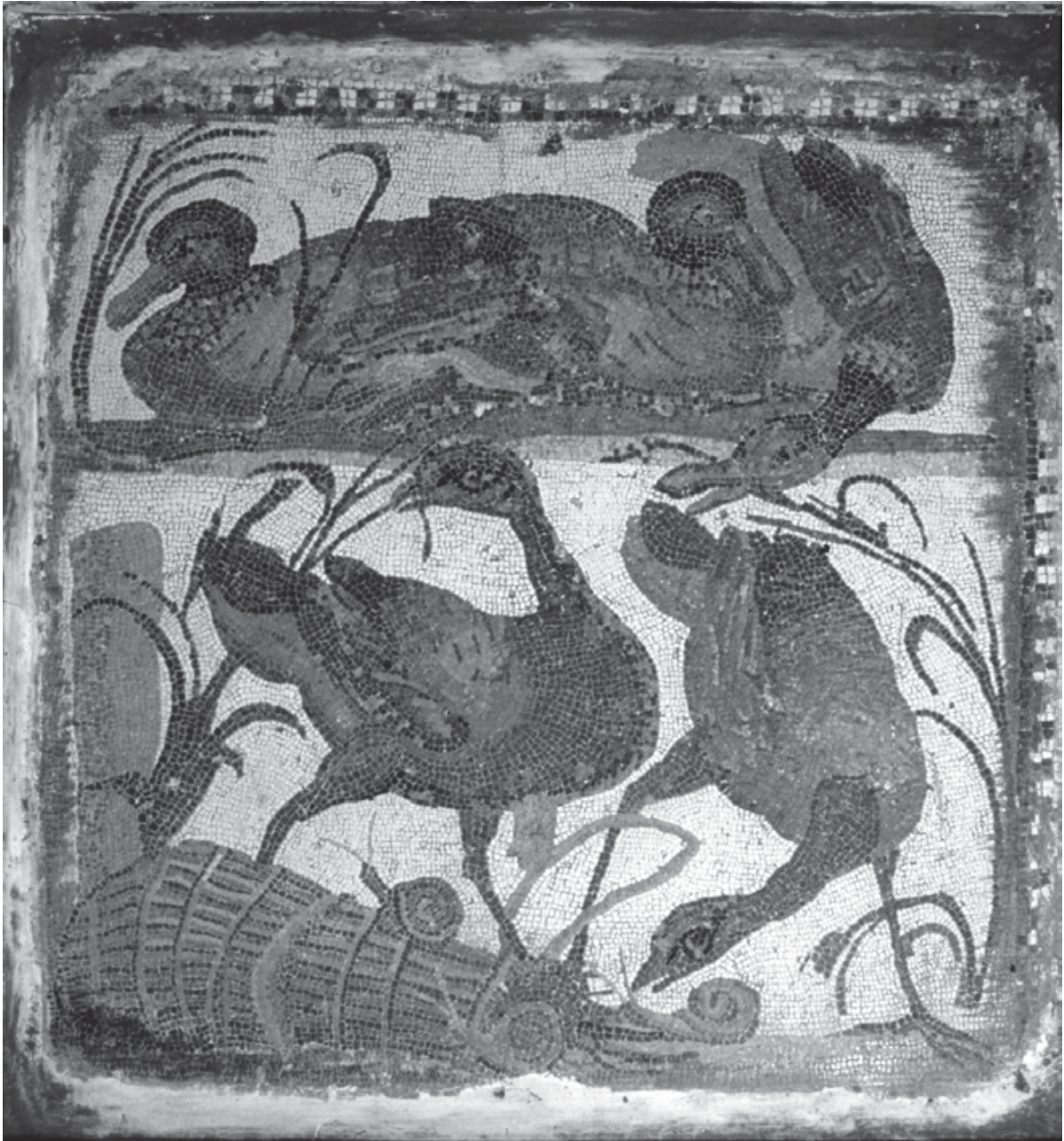
Fig. 3. Mosaic emblema probably from the 1 st c. BC from the area of the horti Caesaris in Rome, now in S. Maria in Trastevere, with two African Swamp-hens ( Porphyrio madagascariensis ) in the lower registre, and three drake Mallards ( Anas platyrhynchos ) in the upper registre.

unusual Fourth Style garden painting in the Casa di Adone ferito (VI, 17, 18) in Pompeii, 26 and another in the 3 rd c. AD paintings in the frieze with