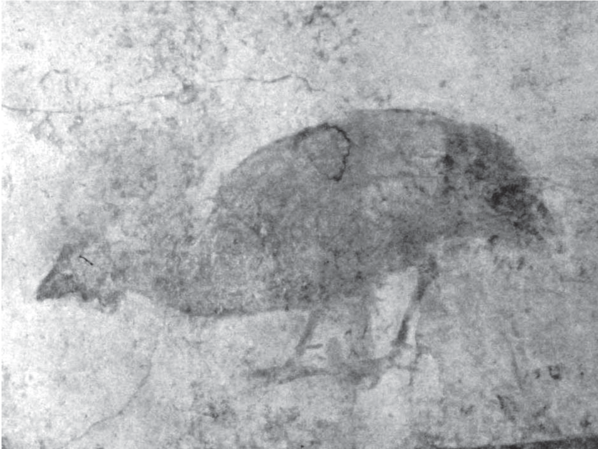
Fig. 5. Purple Swamp-hen ( Porphyrio porphyrio ) with the wattle and spurs of the Domestic Fowl ( Gallus gallus ) in a still life in an early Augustan painting from the Colombario di Villa Doria Pamphili.

identification of the Purple Swamp-hen must be corrected to the African Swamp-hen, both on basis of the colours as well as the Egyptian provenience. 33