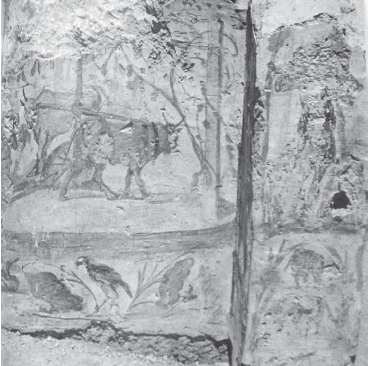
Fig. 4. Painting from the III Wardian tomb (Saqiya tomb) near Alexandria with a water-lifting wheel ( saqiya ) water being indicated with an African Swamp-hen ( Porphyrio madagascariensis ) and a drake Mallard ( Anas platyrhynchos ) in front of it (from H. Riad, Archaeology 17:3 [1964] cover originally in colour).

The dating to the last quarter of the 1 st c. BC of the fragmentary mosaic, possibly from a garden scene or perhaps rather from a still life -like scene from Canopus in Egypt, the latter alternative being suggested by a Cock ( Gallus gallus ) in another fragmentary mosaic deriving perhaps from the same mosaic, has to be taken with reservations. Here my previous