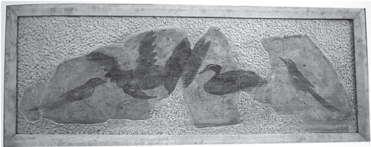
Fig. 2. Lunette from the entrance wall of the Tomba di Morlupo, now in the Museo Nazionale Romano (Rome) with three ducks, in the centre a duck sp. ( Anatinae sp. ), a Shelduck ( Tadorna tadorna ) with a hybrid reddish-violet body probably indicating a sex distinction like the Mallard ( Anas platyrhynchos ), and on both sides two dabbling ducks ( Anas sp. ) with features possibly of the drake Teal ( Anas crecca ) or Garganey ( Anas querquedula ). On the lateral side two passerines ( Passeriformes spp. ), possibly Magpies ( Pica pica ) but rendered with a greyish green plumage as exotic fantasy birds (from Cappelli, 191 fig. 65).