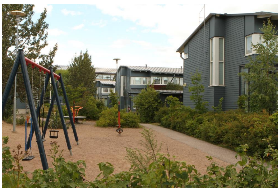
Figure 1. Wooden houses in Viikki eco-district in Helsinki.

basis to a performance-based design basis (Ramage, et al., 2017). For example, in Finland, changes in fire regulations have allowed the use of wood in building frames and façades up to four storeys since 1997, and up to eight storeys since 2011 under standardized conditions (Puuinfo, 2018b), while the eight-storey limit does not apply in the case of individual fire performance analysis. Furthermore, the increasing use of wood in buildings may be encouraged by new environmental policies for the built environment. For example, some cities with carbon neutrality objectives (e.g. Copenhagen, Helsinki, Seattle and Vancouver) support the use of wood as a building material or as fuel. Helsinki municipality has recently made the use of wood materials in the new buildings of Honkasuo district mandatory. This decision was legitimized by the Finnish Supreme Court in 2015 based on the Land Use and Building Act 132/1999 of the Ministry of the Environment, which allows municipalities to supervise and approve plans and projects, including the possibility to introduce design constraints (e.g. the use of specific materials) in urban regulations (Franzini, et al., 2018). However, to underpin the role of wood products in sustainable buildings, there is a need to increase debate (amongst stakeholders) so as to inform future practices and policies in the building sector.