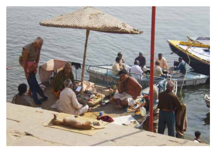
Ghāṭiyā priests at the steps of the Gaṅgā, ready to serve bathers and pilgrims taking care of their clothes as well as performing simple rituals.

king and come back to Kāśī and get release. Although the observances which produce merit are different in these two cases, the relationship with Kāśī is common, and likewise is the result of the merit, namely heaven, rebirth, and final release. Both point to the fact that one does not obtain immediate release if one does not die in Kāśī, but on the other hand the relationship with Kāśī frees one from sins and secures heaven.