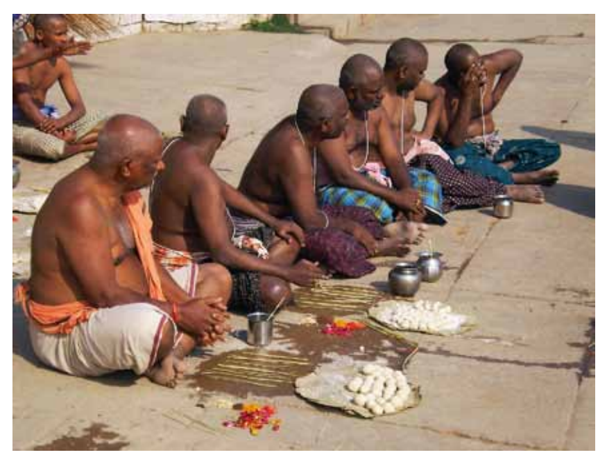
South Indian pilgrims performing ancestral offerings (śrāddha) at Kedāra Ghāṭ.

All in all, the text is a composite work of several authors and cannot be expected to display total internal agreement, as is also the case with most