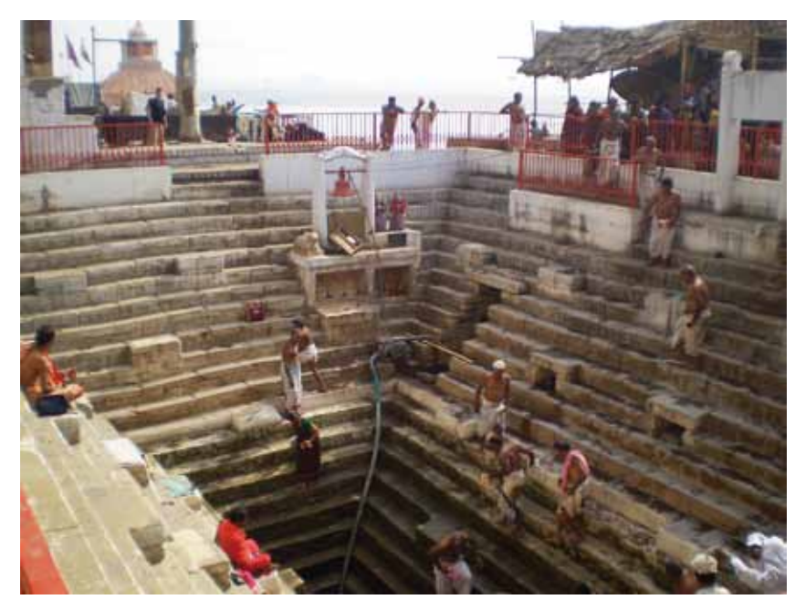
Pilgrims bathing in the Maṇikarṇikākuṇḍa at the Mahāśivarātrī festival.

clearly on the other-worldly gains which Kāśī may give to the pilgrims, and for which it is still famous today.