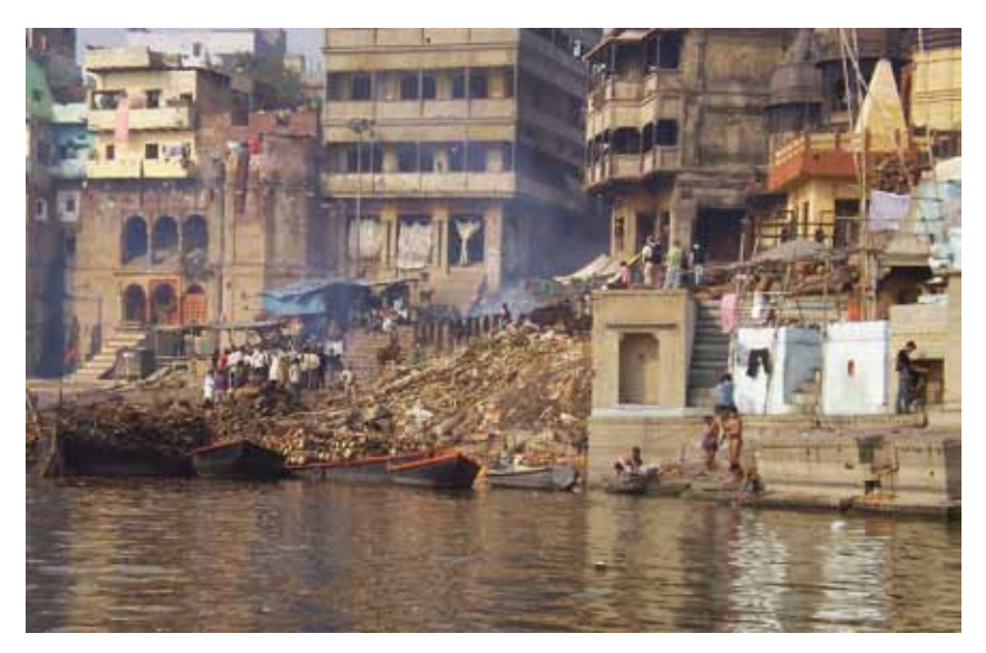
Maṇikarṇikā cremation ghāṭ.

His heap of sins is staying outside because of fear of the Gaṇas roaming the border with tridents and nooses in their hands.