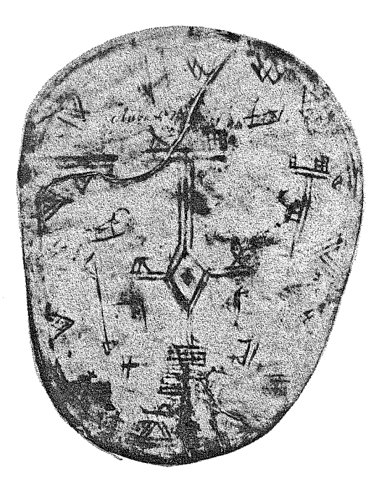
Fig 2 The Sorsele drum Pont's name appears up on the left hand side of the membrane

At the end of his account Plantin writes: