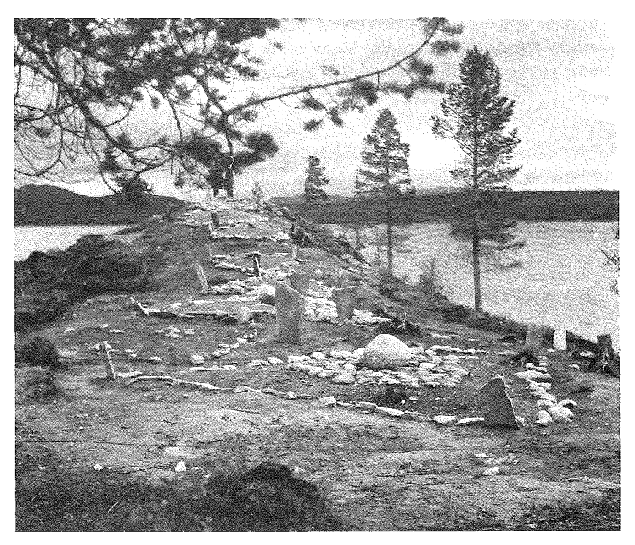
Fig. 3. Krankmårtenhögen, a grave field in north-west Härjedalen from the time of the birth of Christ.