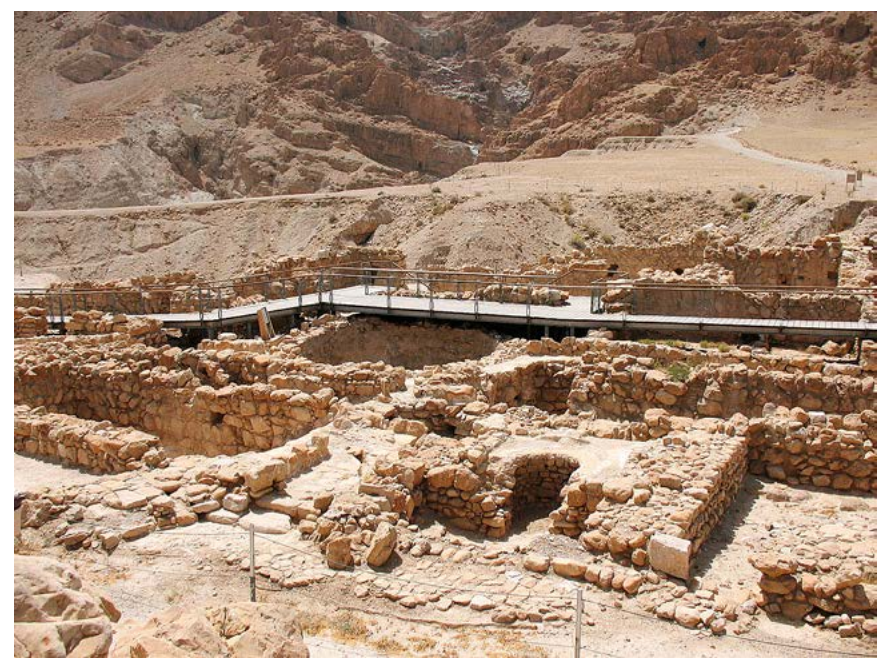
Excavation of Qumran commnity, Dead Sea.

The idea of Jesus as the Messiah, and above all, as a prophet and lawgiver is a continuation of the eschatological- and prophecy-oriented Judaism of the first century that saw Jesus as a prophet with divine authority to teach and interpret the Law. The passage from Deut. 18:15–18 that the authors of both Recognitions 1.27–71 and the Homilies refer to in order to assert the divine authority of Jesus through his identification with the future prophet promised by God through Moses, serves the same purpose in the synoptic gospels: 'While he [Peter] was still speaking, suddenly a bright cloud overshadowed them and from the cloud a voice said, "This is my son, the beloved; with him I am well pleased; listen to him!" (Matt. 3:17; cf. Mark 1:11; Luke 3:22).