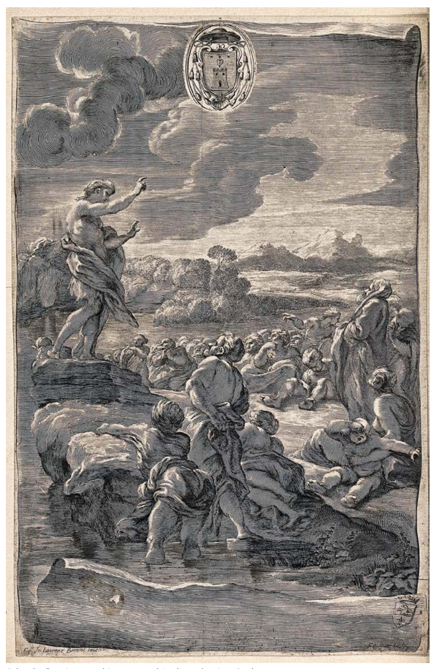
John the Baptist preaching to a multitude at the river Jordan. Engraving by F. Spierre after G. L. Bernini.