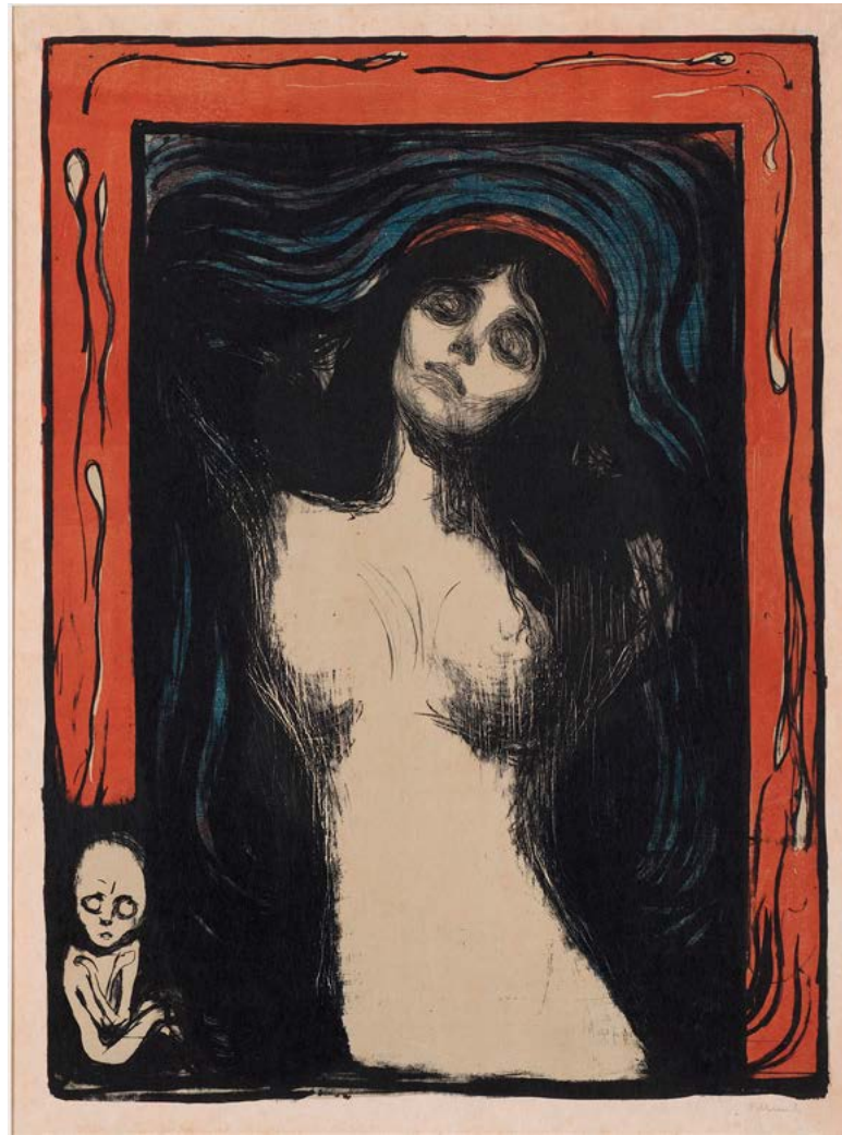
Edvard Munch, Madonna (1895–1902), lithograph.

Moonlight glides across your face – which is full of all earthly pain and beauty. Your lips are like two ruby-red serpents and fleshy as carmine fruit – They gently part as though in pain, a