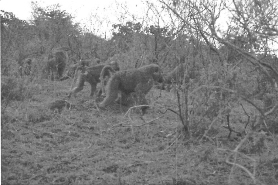
Fig. 18. Baboons are timid but harmful animals (P 95).