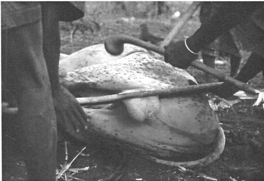
Figs. 15 & 16. Gelding a bull is a skill of its own and requires a lot of expertise (P 81).