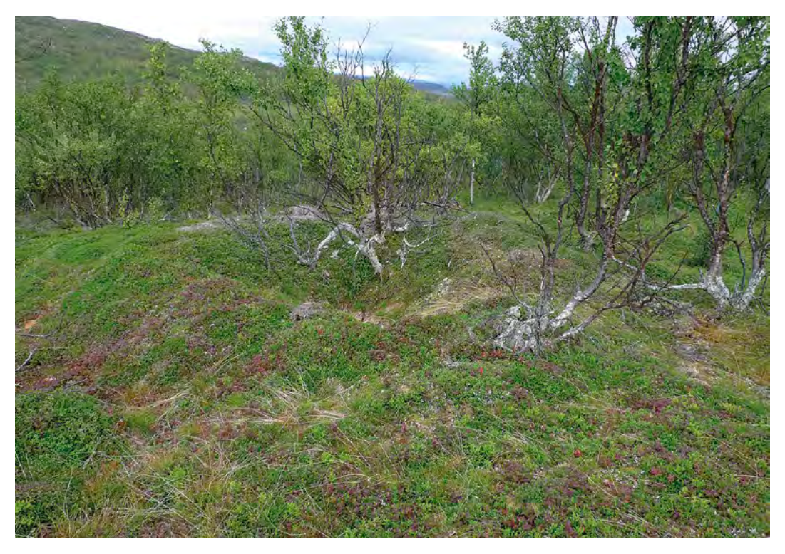
Figure 3. One of the 2,685 pitfalls in the Gollevarre complex.

lers – the upper part being chopped off. In the actual dwellings, finds consisted of the remains of knives, spears, arrow heads and honing stones. In particular, semi-finished spoons of antler were found, which together with quite a few knives indicated a local production of spoons and other items of antler. Due to the large number of processed skulls in the area, this was probably important production meant for a market (Vorren 1998: 127).