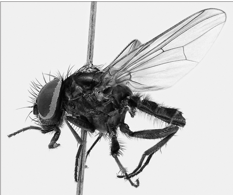
Fig. 1. Fannia alpina Pont, 1970, male. Tip of abdomen detached.

Material examined. FINLAND 1 ♀ Ab : Turku, Satava (67047:32310), 25.VIII.2002, leg. K. Winqvist, caught at light at night.