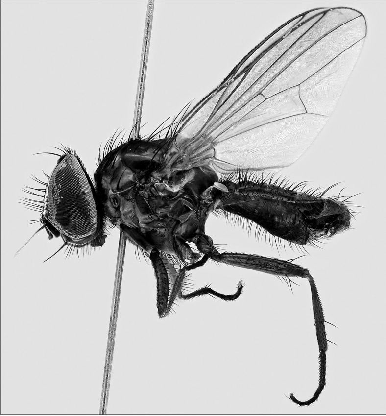
Fig. 2. Fannia slovaca Gregor & Rozkošný, 2005, male. Middle legs missing.

Thorax. Shining black but distinctly grey dusted. Mesonotum without darker longitudinal stripes. Acrostichal setulae triserial. Two prealar setae, length of anterior one about one fourth of posterior notopleural setae. Calypters white and with white fringe. Lower calypter almost as broad as upper calypter.