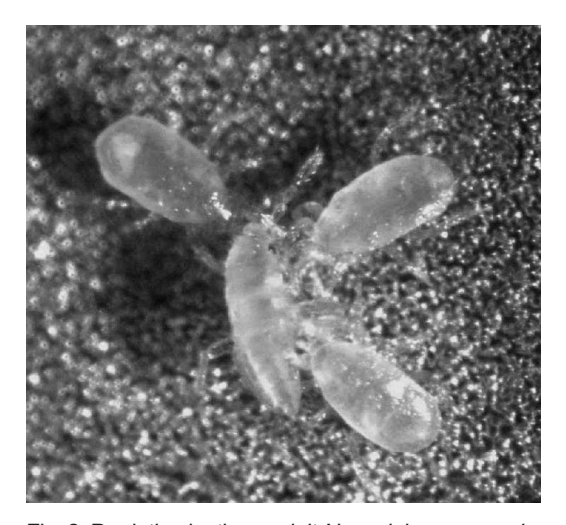
Fig. 2. Predation by three adult Neoseiulus cucumeris on a first instar nymph of Orius albidipennis.

With the extraguild prey present O. albidipennis completely abandoned predation of mite