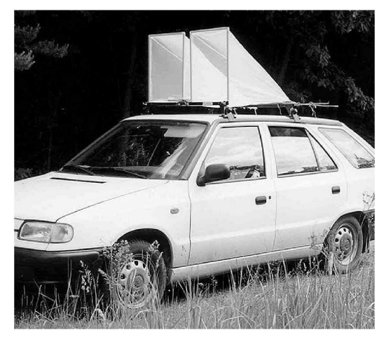
Fig. 1. Car nets mounted on the roof of a car.

Braitava forest of the Czech Republic, using car nets (Fig. 1). Both samples (May 31 – June 1 and July 30–31) consisted of ten ca. 10-km long rounds from morning to dusk, and thus totalled about 200 km.