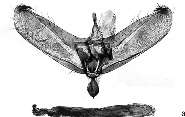
Fig. 2. Genitalia of Tabidia candidalis (Warren). – a. Male, slide 23157, BMNH Pyr., London. – b. Female, slide HGQ12095.