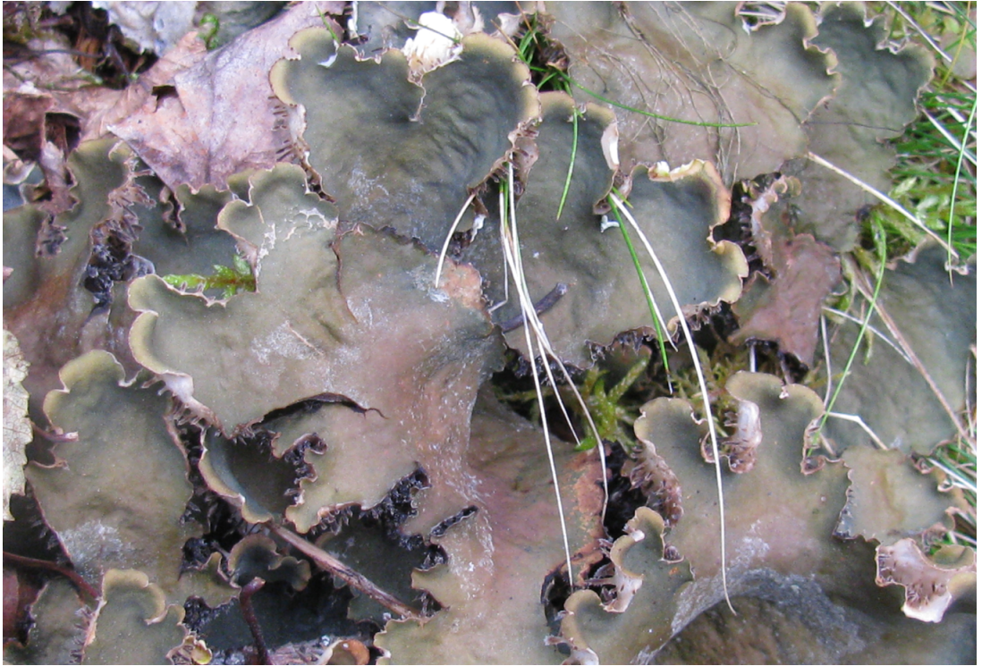
▲ Fig. 3. Peltigera retifoveata Vitik., 8.8.2010 Kuusamo, Juuma.