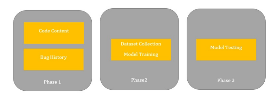
Fig. 1. Three phases that are used to create the model for class prioritization during regression testing.