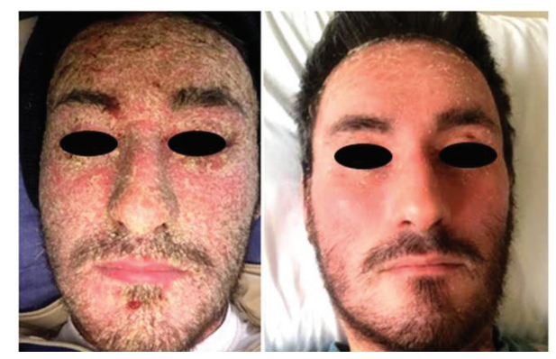
Figure 2. Face detail, before and after therapy.

Blood tests were performed again. Due to the finding of HIV positivity, therapy with ixekizumab was discontinued and HAART therapy was started.