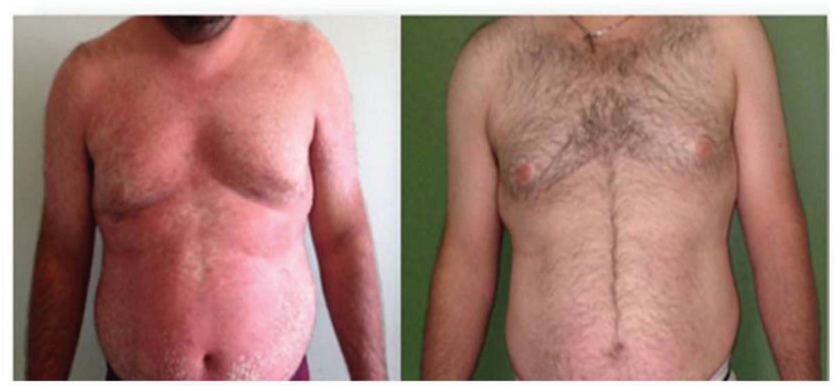
Figure 3. Trunk detail, before and after therapy.

After 6 months, given the stability of the viral load and CD4 levels, therapy with ixekizumab was resumed, with monthly control of the CD4 count and viral load.