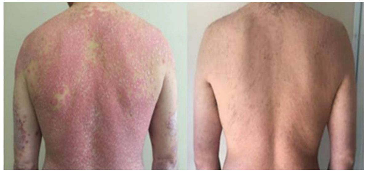
Figure 4. Shoulders and trunk detail, before and after therapy.

A 37-year-old man with a 1-year history of moderate-to-severe plaque psoriasis was referred to our department for a flare-up of a skin lesion (PASI 39), joint tenderness, and swelling on both hips and both thumbs.