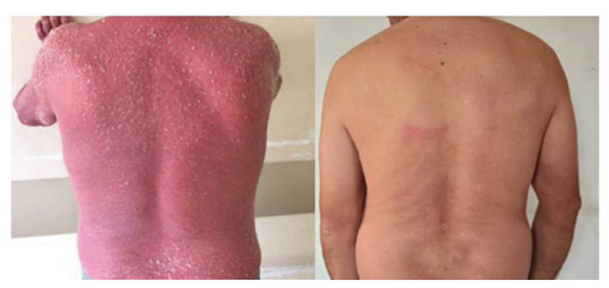
Figure 1. Shoulder and back detail, before and after therapy.

near-total clearance of EP, particularly within the IL-17 class. Secukinumab, ixekizumab, and brodalumab achieve almost complete clearance of EP symptoms after 8 to 12 weeks of treatment (3,4).