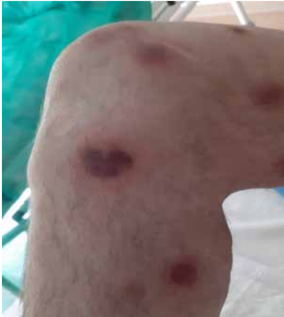
Figure 1. Red nodules in the subcutaneous tissue on the lower extremities.

A month earlier, the patient had taken ranitidine ad hoc to treat chronic gastritis. He denied respiratory and gastrointestinal infections as well as symptoms from the digestive tracts such as abdominal pain, nausea, vomiting, weight loss, diarrhea, or constipation in the period preceding the occurrence of skin lesions. He denied alcohol abuse. He reported drinking little alcohol and only occasionally. Past medical history was significant for chronic gastritis, perforation of gastric ulcer, laparoscopic cholecystectomy, acute pancreatitis of unknown etiology (2012), surgical treatment of a hernia of the nucleus pulposus in the lumbar region (1995), and surgical treatment of the varices of the right lower limb.