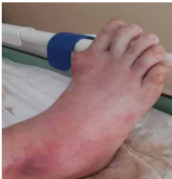
Figure 4. Painful, swollen ankle joint – tender on palpation

infusion 4.2 mL/h IV (6 mg daily), then 3.1 mL/h IV (3mg daily). The patient was administered a narcotic painkiller in response to strong joint ache. The new treatment regimen resulted in a significant reduction of pancreatic (amylase 100 U/L, lipase 64 U/L) and inflammatory parameters (CRP 95.5 mg/L, WBC 14 500 / \mu L, Neu 12 290 / \mu L). An endoscopic ultrasound study (EUS) of the pancreas revealed a hypoechogenic mass 30x25 mm in size with calcification localized in the head of the pancreas. The parenchyma of the pancreas showed fibrosis. The pancreatic duct measured 3-4 mm in diameter at the head of the pancreas. The biopsy also revealed normal pancreatic benign epithelio-glandular cells.