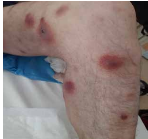
Figure 2. Red nodules in the subcutaneous tissue on the lower extremities

Laboratory tests showed elevated levels of inflammation markers (CRP 361.9 mg/L, WBC 27 800/ \mu L, Neu 25 630/ \mu L, Procalcitonin 0.73 ng/mL) and moderately elevated liver function tests: AST 63 U/L, ALT 53 U/L. They also revealed elevated pancreatic parameters: amylase 9673 U/L (normal range 28-100 U/L) and lipase >21 585 U/L (normal range 13-60 U/L). Contrast-enhanced CT of the abdominal cavity revealed a mass measuring 27×19 mm surrounded by calcifications, localized in the uncinata process of the pancreas. The pancreatic duct was narrowed. Labora-