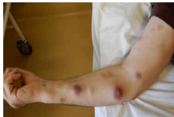
Figure 3. Red nodules in the subcutaneous tissue on the upper extremities

A suspicion of pancreatic tumor and PPP syndrome (pancreatic disease, panniculitis, polyarthritis) arose. The patient was treated with somatostatin