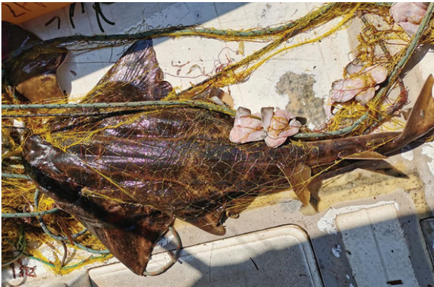
Fig. 3. Adult female caught with neonates and successfully released alive in the Zadar-Šibenik archipelago.

by predatory species, and presents an ideal breeding/nursery ground for adaptive type. Since there were almost no records in past decades, neonates, juveniles, subadults and adults observed over the last year might easily suggest that common angel shark gives birth in the Zadar and Šibenik archipelago (Fig. 1). Thus, this paper aims to point out a plausible breeding/nursery ground and draw attention to the urgency of locating breeding and/or nursery grounds to establish spatial fishing bans and/or other species-specific conservation actions to ensure both revitalization and more effective long-term in-situ conservation. WWF Adria already implied that the sea area around the island of Molat (Zadar archipelago) might be one of the plausible breeding sites, but without precise evidence in their reports. Adult female caught with its offspring (Fig. 3), which were successfully released alive, together with other neonatal and juvenile specimens recorded present one of the most important hopes for the critically endangered angel sharks in the eastern Adriatic.