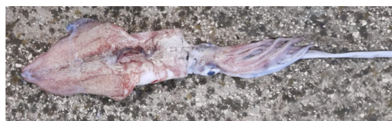
Fig. 3. Specimen of European squid Loligo vulgaris caught on 19 th April 2020 in Neretva River near town of Metković, approximately 20 km inland in Croatia.

fied from the photo as Brown ray, Raja miraletus on the basis of visible morphological characters described by STEHMANN & BÜRKEL (1984). It measured approx. 40 cm in total length and weighed approx. 400 g. The record of R. miraletus so high upstream inland in the Neretva River represents also a curiosity in the context of the distribution of this species. Although according to FROESE & PAULY (2021) this species can be found in brackish waters, there is no evidence of it being recorded in rivers high upstream.