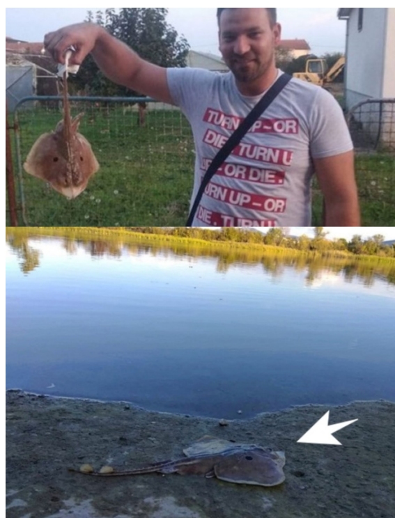
Fig. 2. Specimen of Brown ray Raja miraletus caught on 7 th November 2019 in Neretva River near town of Čapljina, approximately 25 km inland in Bosnia and Herzegovina. White arrow indicates the specimen.

In November 2019, an interesting catch of a specimen of ray species has been reported on a website of local radio Čapljina (Bosnia and Herzegovina). The specimen was caught in the Neretva River near the small settlement Višići (Bosnia and Herzegovina), about 25 km upstream off Neretva River mouth (43°03'38.50 N, 17°42'00.19 E; Fig. 2). The specimen was found alive in the shallow water on the muddy bottom and was caught by hand. It was identi-