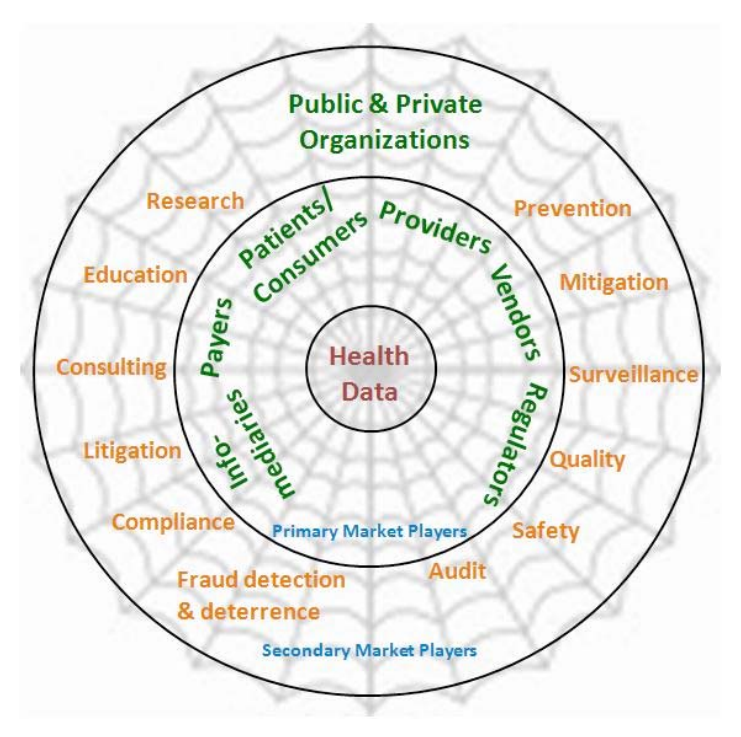
Figure 1: The e-health ecosystem.

reduce the IT infrastructure costs of healthcare organizations by three to five times [27], and to eliminate the IT maintenance costs that are major roadblocks to EHR adoption [74]. Besides these benefits, cloud computing offers an infinite and elastic structure which can drive profitability for healthcare providers by improving resources utilization and increasing their scalability [75].