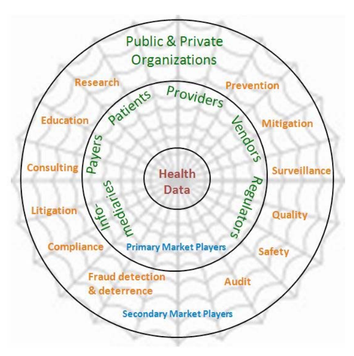
Figure 1: E-Health Ecosytem.

Based on this background, we have attempted to diagrammatically represent the e-health ecosystem which is as shown in Figure 1.