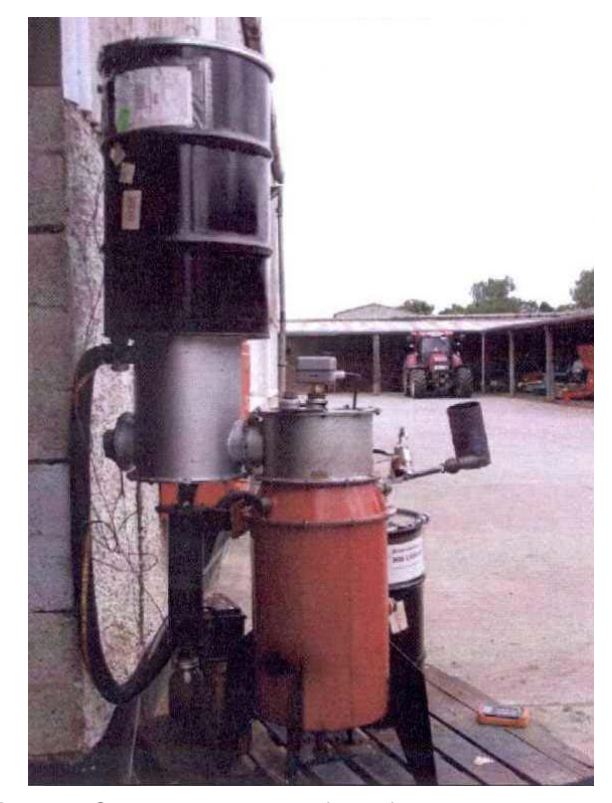
Figure 1: GEK Imbert down-draft gasifier.

The gasifier used in this investigation was a GEK Imbert down-draft gasifier<sup>2</sup> which consists of a hopper for feedstock storage, a reactor where the gasification process occurs, a cyclone, and a charcoal filter through which the synthetic gas passes en route to a flare (Figure 1). The rate of biomass flow is controlled by gravity and is fed into the reactor by means of a feed-in auger. The rate of gas flow is controlled by an air compressor which controls the pressure over the gasifier: increasing the flow of air increases the pressure over the reactor and thus increases the flow of gas through the gasifier.