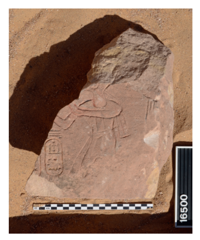
Fig. 13.2 Fragment of relief in the name of Ramesses IX from the temple at Amheida (Excavations at Amheida, photo B. Bazzani).

A small relief fragment in sandstone found at the temple of Amheida preserves the throne name Neferkare Setepenre of Ramesses IX (ca. 1129–1111) in a cartouche (Fig. 13.2). The piece is broken on all sides, and its surviving measurements are 22 x 12 cm for the original surface, with a preserved thickness of 25 cm. The fragment is carved in sunk relief, and it