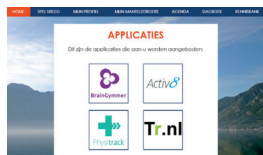
Fig. eRehabilitation intervention with applications for physical and cognitive exercises, activity monitoring and stroke-related education.