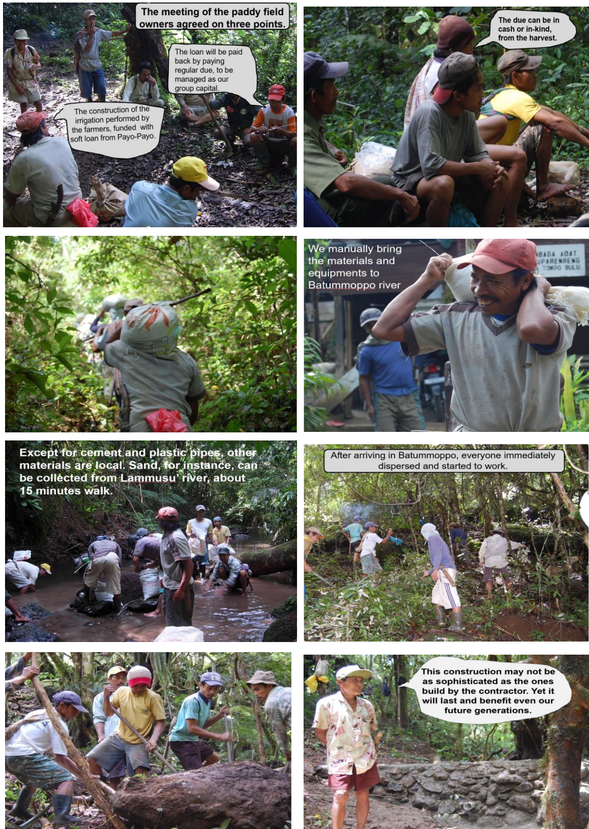
Figure 3. The 'collective action': working on building dam irrigation

Through a series of discussions with more farmers, it was concluded that this project is feasible and will be materialized. Previous to discussing the overall financing, the farmers convened to discuss the technical specification of the initiative. They came up with the idea that in order to channel the water from the upstream of Batummoppo to the rice fields in Lompo Lebang and Acce', a