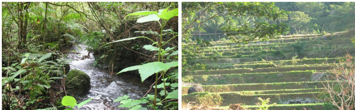
Figure 1. Tompobulu village is located within the Bantimurung-Bulusaraung National Park area.

Once upon a time, according to the belief of the Tompubulu community, there was a large rock rolling from the top of Mount Saraung to the river that runs at its feet. The river where the rock stopped was named the Batummoppo River. It is a small river that originates and flows from the forest of Mount Saraung in the Bantimurung-Bulusaraung National Park area (see Figure 1). In the Dentong Language—the language spoken by the people of Tompobulu, a variant of the Makassar language—'Batummoppo' means 'batu' (stone) and 'moppo' (rolling down and then sitting still), combining to mean a stone that falls and then sits still.