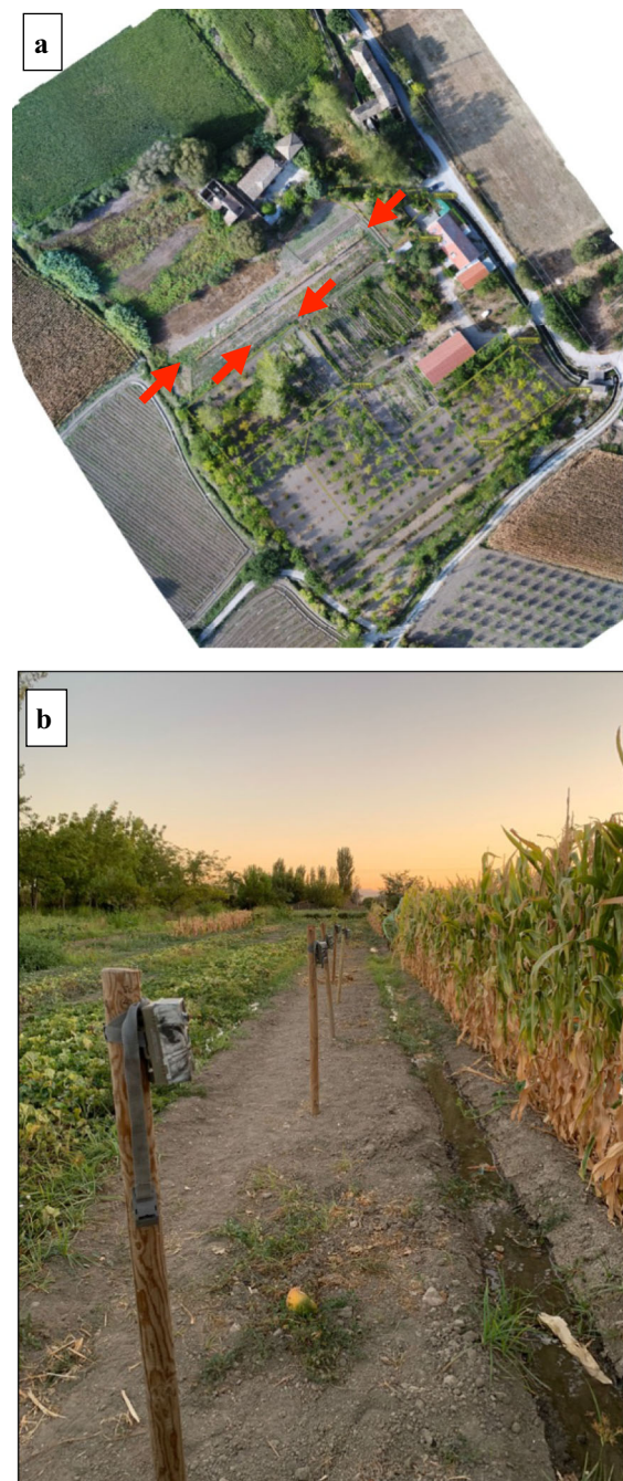
Fig. 1 a Study site (“Huerta de la Paloma” farm) in detail; red arrows show the initial and final points of the furrows of maize used in the study. b Furrows of maize (popcorns red and blue) with camera traps installed at regular intervals on poles 1.5 m from the plants. Red arrows mark the beginning and the end of the furrows of popcorn (larger line) and Pioneer (shorter line) cultivars.

The study was conducted during the summer of 2020 in the Vega de Granada, a flat and irrigated agricultural area of small-sized farms located at ca. 650 m a.s.l. The entire area is used mainly for crop production, mostly vegetables, maize, tree plantations, and pasture. The soil is deep and loamy, and the climate is Mediterranean-type, with hot, dry summers and mild winters. The mean annual rainfall is 388 \pm 29 \text{ L m}^{-2} \text{ y}^{-1} and the mean temperature is 15.3 \pm 0.1 \text{ }^\circ\text{C} (period 2006–2020). The study was performed in “Huerta de La Paloma” farm (study site hereafter), a private property 1.8 ha in size located in the “Vega de Granada” (SE Spain, 37^\circ 10' 03.43'' \text{ N} , 3^\circ 36' 57.80''