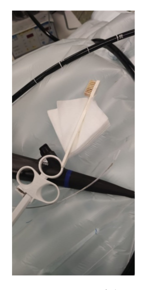
Figure 2. Image of the used endoscope and the toothbrush once removed.

The fb described above was observed in the stomach with no lesions on the oesophageal or gastric mucosa. The fb was successfully removed via endoscopy using a polypectomy snare videogastroscope Olympus GIF-1100 (Olympus Iberia, Barcelona, Spain) (Figure 2). After three hours of monitoring, the patient was discharged.